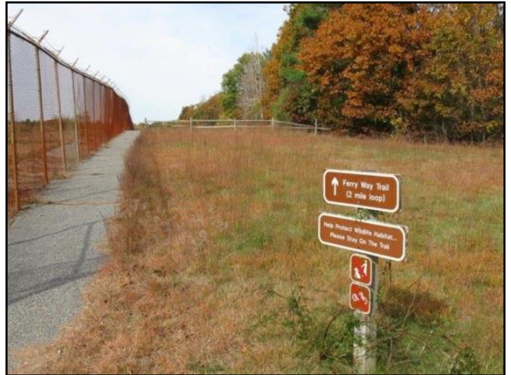
The trail initially runs along the former weapons storage area fence line before heading off on a two mile loop through wetland, meadow, and forest.

At one spot along the shoreline, it was only about a 200-yard span to the far shore across the Great Bay's rushing, tidal waters. And, as more settlers arrived and busied themselves trying to eke out a living here, at least one of them saw the need for a link between the two shores at this location where he lived. So, in 1694, William Furber sought and received a license to set up a ferry. The square-ended craft carried people, animals and goods across the 40-foot deep, fast-moving current. It went between what is still called Welsh Cove, where Furber's house was, over to what was then called Mathes Neck, now Adams Point. Old records show that there were two docking places at the neck on the east side of the strait. A trip to the first one cost an individual three pence, and a man and his horse eight pence. If they docked at the second one, it was six pence for one person and twelve