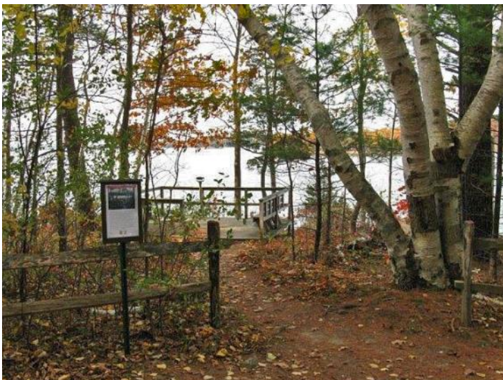
An observation deck along the Ferry Way Trail affords a view of Great Bay and the site where the Furber Ferry once operated.